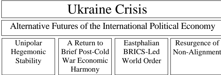
Figure (1): Four Alternative Futures Following the Ukraine Crisis