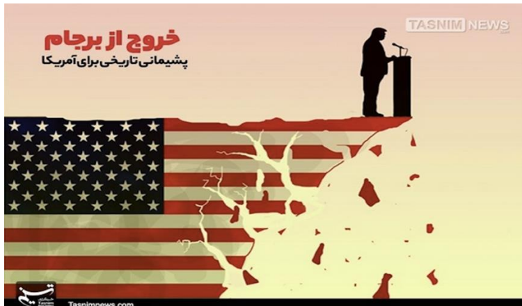
Figure 3. [Abandoning the JCPOA: A Historical Regret for the United States], Tasnim News Agency, May 8, 2018

US Shot Itself in the Foot: Another major framing of Trump's unilateral withdrawal from the JCPOA in Iranian newspapers, is representing Trump and by an extension the United States as the party that has deprived itself from the benefits of the JCPOA. The cartoon depicts Trump's podium on the verge of collapse and the US flag (as a symbol of American integrity and identity) being shattered. Similar cartons in Fars, Mashregh, Khorasannews and donya-e-eghtesad are published on the Americans as the major loser of Iran deal withdrawal.