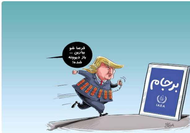
Figure 2. [Trump's Terrorist Attack on the JCPOA], Fars News Agency, May 24, 2018

Another similar cartoon, figure 2, depicts Trump running uncontrollably toward a sign holder with the JCPOA and IAEA written on that, with TNT around his waist and ready to explode himself. An unknown figure is shouting, “bring his pills...he has gone crazy again”.