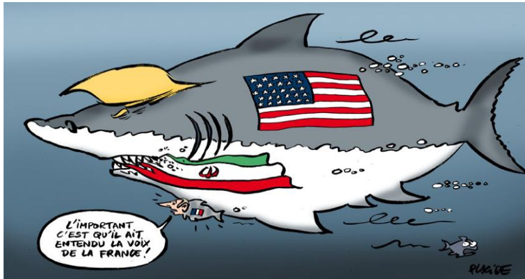
Figure 6. Placide, “Trump déchire l'accord sur le nucléaire iranien” [Trump tears up Iran’s nuclear deal], I-Echo.fr, May 9, 2018.

This unilateralism is also visible in drawings where the cartoonists portray the nuclear agreement as “USA-Iran agreement”, which is contrary to multilateral nature of the agreement between Iran and the P5 + 1. In this regard, Charlie Hebdo ’s cartoonist did not hesitate to take title of “Iran rejected by Trump” on occasion of the American withdrawal from the JCPOA. This drawing depicts an Iran turned into a country trying to mimic America’s policies to “please” Trump. From his verbal signs “slogan of Make Iran great again ” to his appearance (Trump’s haircut followed by the Pasdarans), 1 through his obsessions (excessive use of Tweeter), this drawing not only includes features related to Trump, but also American culture (Mc Do, Hollywood) or other famous American personalities (Spielberg, Harvey Weinstein). According to the cartoon, Iran may well assimilate to the American life style and conform to Trump's obsessions, this staging promoted by a “mullah” in middle of the drawing failed to prevent Trump from “rejecting” Iran. The latter then takes the United States as its main interlocutor and exit of Trump is considered as an American rejection vis-à-vis Iran; meanwhile France is absent in all these