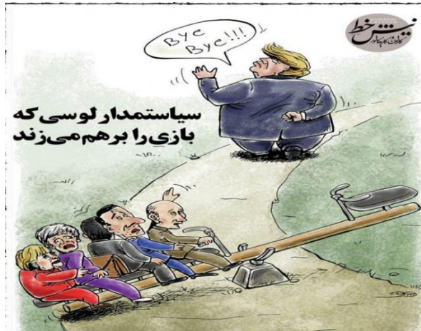
Figure 4. [A Spoiled Politian Spoils the Game], Nishkhand, 13 May, 2018.