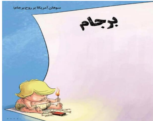
Figure 1. [US Polishes the JCPOA's Spirit], Shargh News Agency, June, 2, 2018

Another similar cartoon, figure 2, depicts Trump running uncontrollably toward a sign holder with the JCPOA and IAEA written on that, with TNT around his waist and ready to explode himself. An unknown figure is shouting, “bring his pills...he has gone crazy again”.