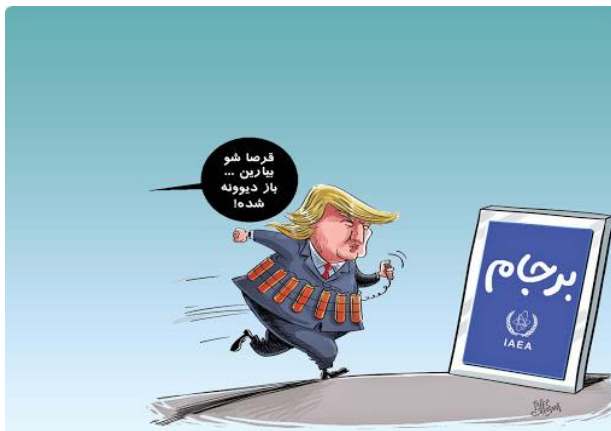
Figure 2. [Trump's terrorist attack on the JCPOA], Fars News Agency, May 24, 2018

Another similar cartoon, figure 2, depicts Trump running uncontrollably toward a sign holder with the JCPOA and IAEA written on that, with TNT around his waist and ready to explode himself. An unknown figure is shouting, “bring his pills...he has gone crazy again”.