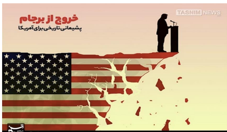
Figure 3. [Abandoning the JCPOA: A Historical Regret for the United States], Tasnim News Agency, May 8, 2018

US Shot Itself in the Foot: Another major framing of Trump's unilateral withdrawal from the JCPOA in Iranian newspapers, is representing Trump and by an extension the United States as the party that has deprived itself from the benefits of the JCPOA. The cartoon depicts Trump's podium on the verge of collapse and the US flag (as a symbol of American integrity and identity) being shattered. Similar cartons in Fars, Mashregh, Khorasannews and donya-e-eghtesad are published on the Americans as the major loser of Iran deal withdrawal.